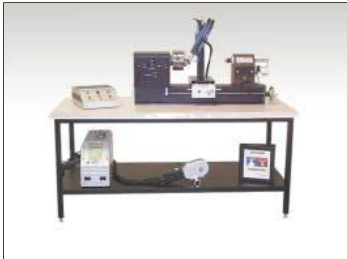
Lathe welding systems accommodate round parts.