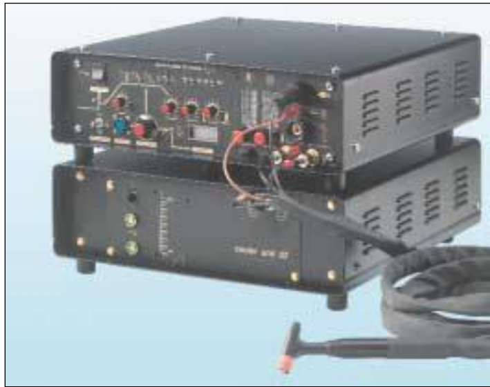
Power supplies from Pro-Fusion Technologies Inc., support both Micro-TIG and Micro-Plasma processes.

In the micro-TIG welding process, a high-voltage, high-frequency pulse starts an