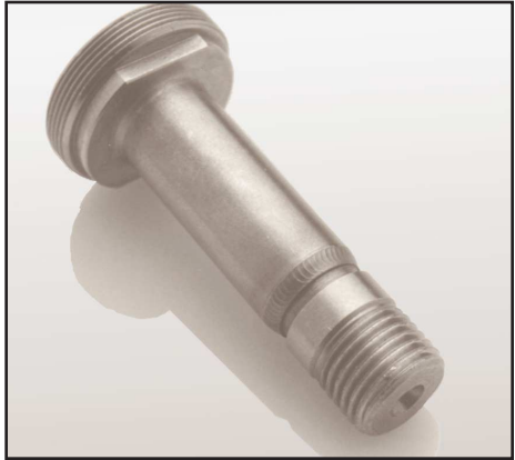
A variety of parts of all sizes can be joined with precision arc welding techniques. Note the pulsed arc finish on the weld surface.

These controllers are used by manufacturing organizations for medium to large