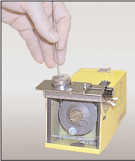
A typical tungsten electrode grinder.

in place and an orbital weldhead rotates an electrode around the part to make the required weld. Orbital welding systems are used for welding tubing in industries such as aerospace, boiler tubing, food and dairy, nuclear, pharmaceutical, and semiconductor.