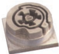
Tool & Die