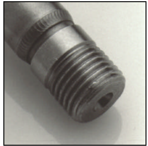
Figure 2. These small parts were joined using an arc-welding technique. Note the pulsed arc finish on the weld surface.

The trials and investigations of the past in advancing the welding process have brought new triumphs in welding, improving quality and precision, and leaving less waste. These are lessons that when applied, can offer